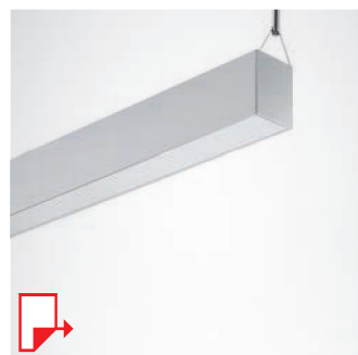
pg 73 SL787+ RE