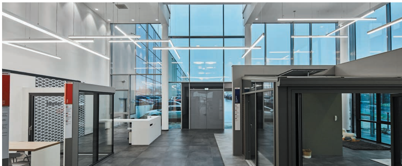
Finstral Customer Center - Gochsheim - Germany